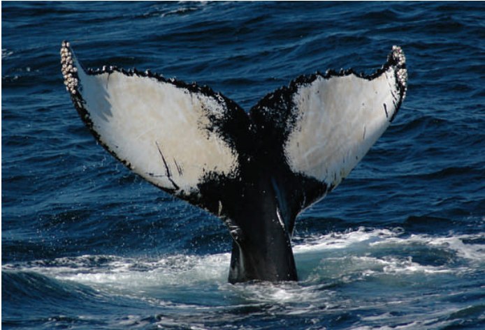
Each humpback tail has a unique black & white pattern on the bottom surface. This is SALT